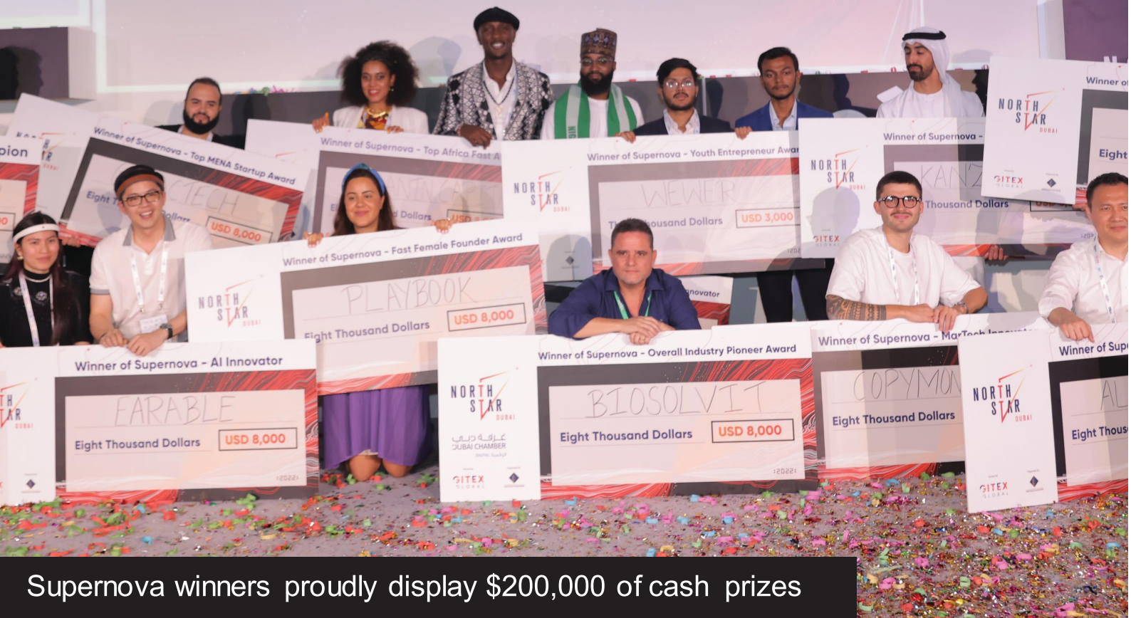
Supernova winners proudly display $200,000 of cash prizes

CASH PRIZES DOUBLED TO $200K LARGEST CASH PRIZE AT ANY STARTUP EVENT